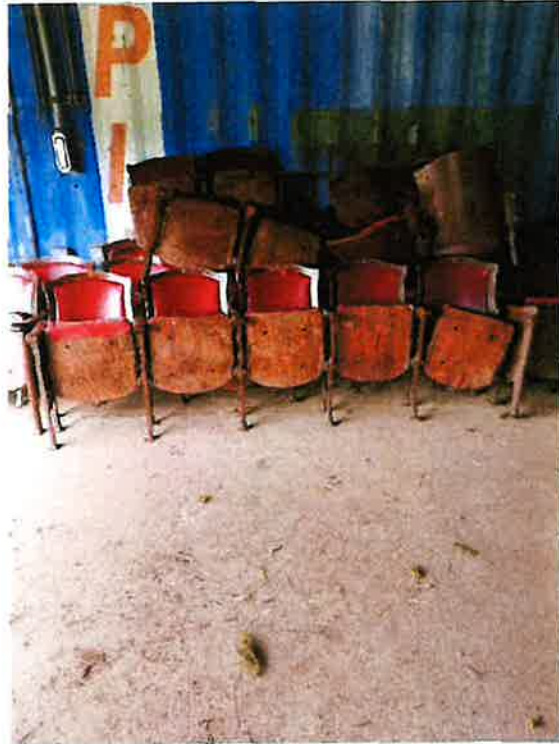
Theater style seats