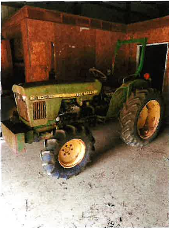
Broken John Deere tractor, (zero trade-in value)