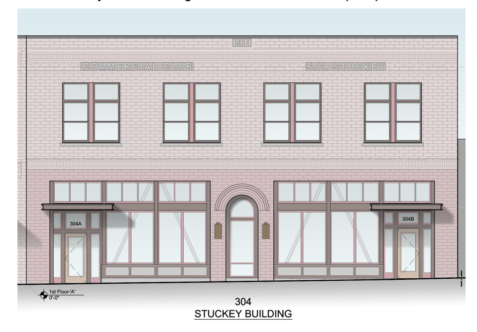
The proposed main façade of Stuckey Page 7 of 18 3rd & Ferry Street Development – Historic Property Request for Change Narrative

The brick and mortar joints were cleaned and retooled within the last decade, and will be reexamined for any additional work needed. The brickwork at the first floor was at one time painted, and that paint was aggressively removed, damaging the weather-face finish of the brick. To protect the brickwork, it is proposed to apply a protective layer of paint at that location only. The building date and names at the parapet will be cleaned and kept in place.