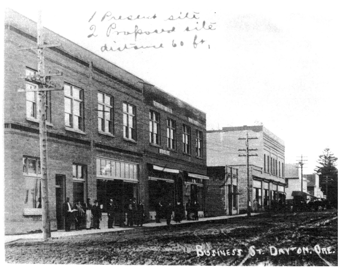
An early image of Dayton's commercial core, showing the original configurations of the three buildings, and the demolished Opera House at the far extents of the block.