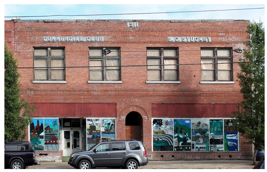
A contemporary image of the Stuckey Building