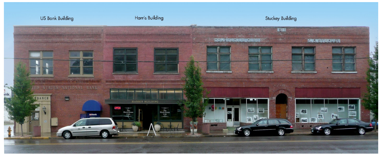
Ferry Street View