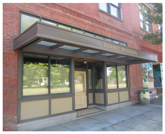
A contemporary image of the Harris Building