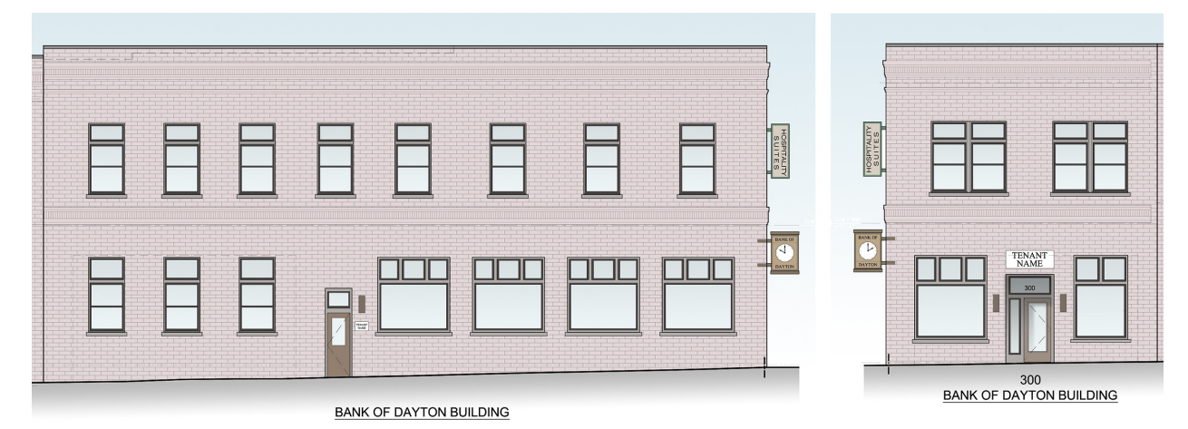
The proposed Bank of Dayton Building, 3rd Street façade, left, and Ferry Street façade, right

the creation of an alcove for the main door, allowing the door to operate not in the public right-of-way, as required by code.