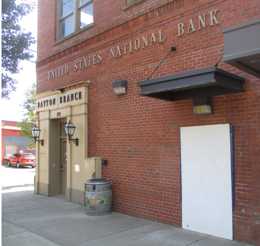
A 1940s image of the Bank of Dayton building, left, and a current photo, right