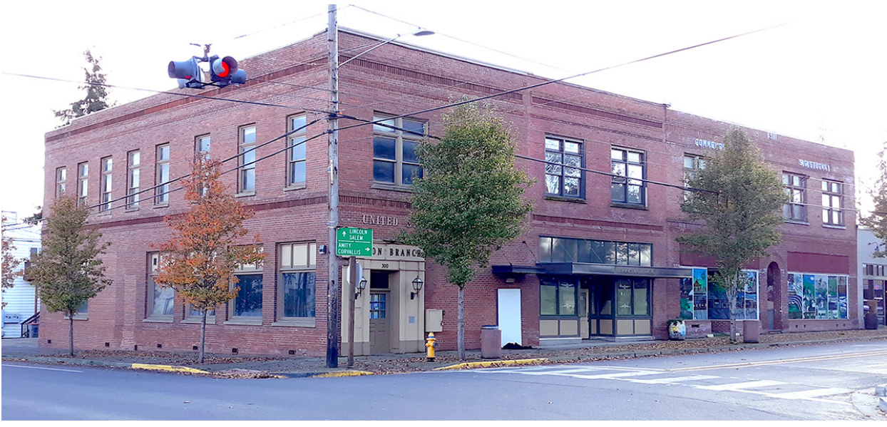
A current photo of the development site, at the corner of 3rd and Ferry Streets

the Dayton Multiple Property Nomination, and as such are listed in the National Register of Historic Places. The Bank of Dayton Building (its original name) was not listed as a contributing structure, likely due to heavy alterations of its original façade.