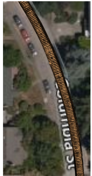
Multichannel antenna array collection vehicle, and sample data from historical trolley rail ties in Eugene OR