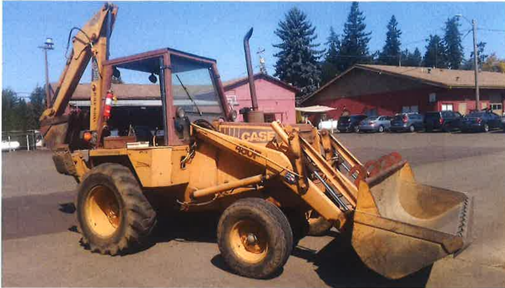
Case 480F Backhoe that is over 20 years old that is a candidate for surplus. This piece of equipment was purchased as surplus and is need of extensive repair. This equipment has an approximate value of $19,000.00