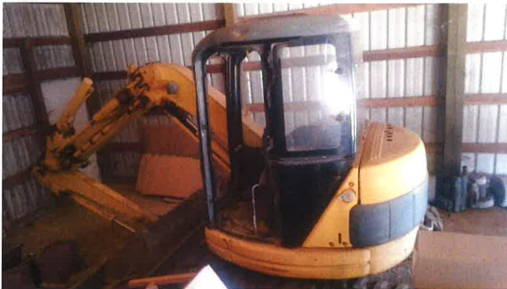
1994 Komatsu excavator was purchased as surplus in 2009 and is need of extensive repair. This piece of equipment has not been in service since 2012 when the city purchased a vacuum trailer for excavations. This equipment has an approximate value of $8000.00